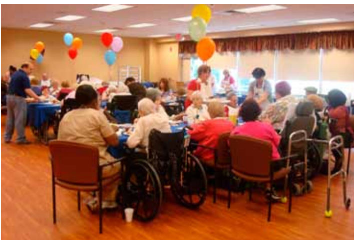
The Home hosts BBQs for the residents every week throughout the summer. However, the July heatwave had the residents dining indoors rather than outdoors for most of the month.