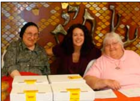
DOI RESIDENT COUNCIL CHARITABLE FUND Leading Age NJ Amos Willcox Award 2011