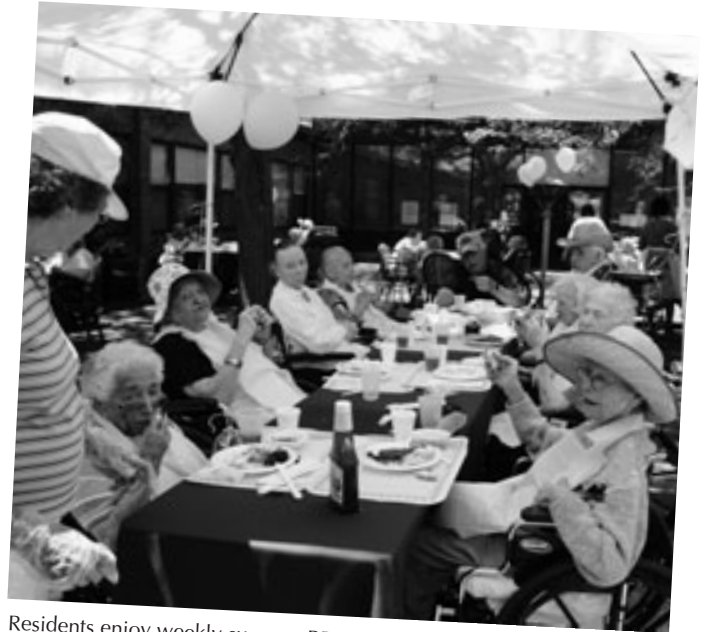
Residents enjoy weekly summer BBQs on the Home's many outdoor patios. For those who prefer to dine inside, their order is taken and grilled according to their specifications from medium well-done to charred!