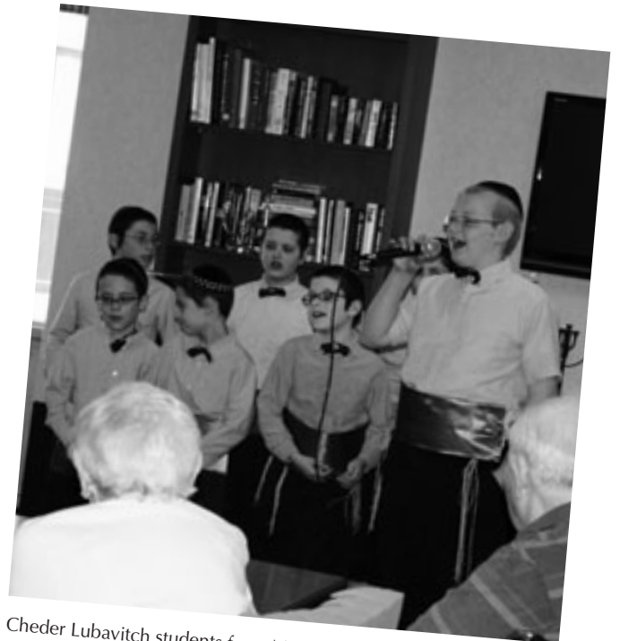
Cheder Lubavitch students from Morristown present a pre-Shabbat song celebration to residents on a Friday afternoon.