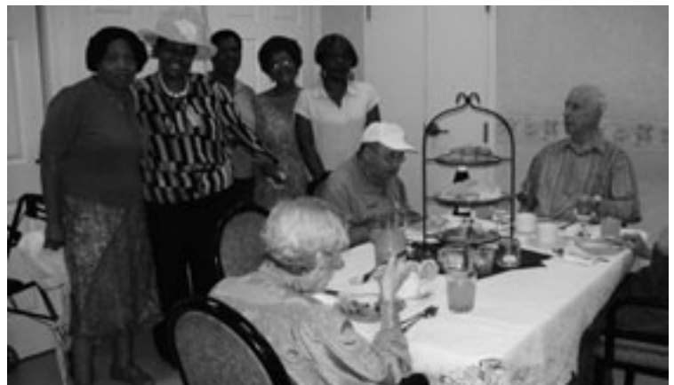
Residents at the Charles Bierman Home enjoy a lavish "High Tea" luncheon on June 30, 2010.

The Bierman Home also provides a full plate of recreational activities and entertainment. Some event highlights over recent months include a 4th of July indoor celebration and barbeque, and a lavish "High Tea" luncheon. The residents also enjoy trips to the Papermill Playhouse, most recently having seen Smokey Joe's Café and Lost in Yonkers. The Bierman residents also take trips on a monthly basis to eat out in various restaurants, with Noah's Ark in Teaneck being one of their favorite lunch spots.